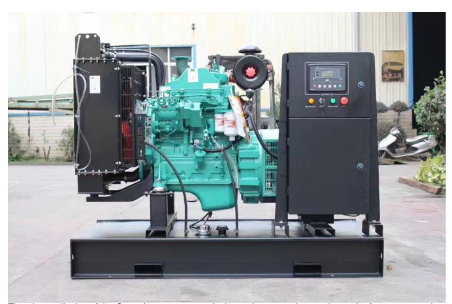
The picture display of the Cummins open type unit shows that every time we leave the factory, we undergo full load testing to ensure that the machine can be quickly used by customers.