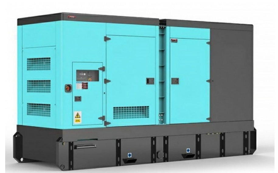
The picture display of Cummins silent unit shows that we have a complete installation process and factory debugging system. Can achieve perfect factory delivery.